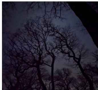
WINTER OAK.